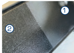
POWDER COATING PAINT (2) ADDED TO KTL PLUS (1). NO RUST AND NO SALT STAINS.