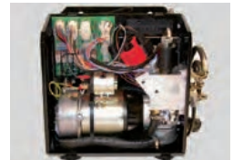
LOW NOISE POWER UNIT & NO ELECTRONICS = EASY MAINTENANCE