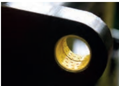
LOW MAINTENANCE BUSHES AND CHROMIUM PLATED PINS.

The above mentioned weights are approximate and may vary according to production. Anteo reserves the right to change weights and technical specifications without prior notice. No indemnity for damages can be claimed from Anteo for changes in technical specifications and/or in weight.